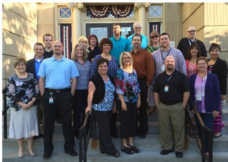
Idaho On-Site Go-Live Team, Twin Falls County